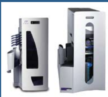
Automated CD/DVD/BD recording, printing and reading thanks to the state-of-art Rimage production robots.