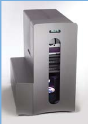
Rimage Producer III CD/DVD/BluRay autoloader